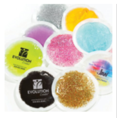
Cool Jaw's® T-430 Soft-sided Round Gel pack is ideal for a variety of cold therapy applications.

Cool Jaw® has paved the way to post-operative hot/cold therapy through the creation of our Soft Stretch Wrap. Our Soft Stretch Wraps are made of elegant, satin spandex fabric that is extremely soft on the patient's skin. Soft Stretch Wraps (T-800, T-800C and T-900C) are specifically designed to fit our